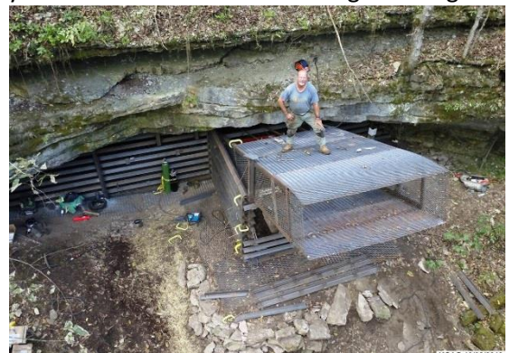
Drone view of Cobb Cave gate under construction. (Note the fish-plate arrows, to direct bats toward the new entrance.)