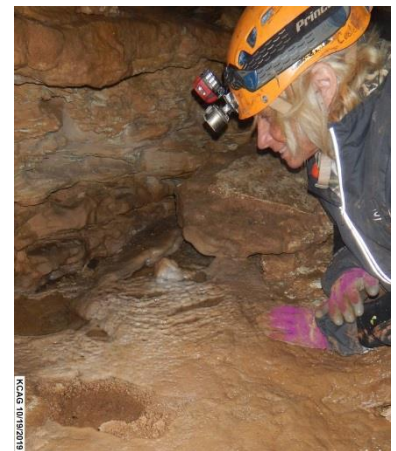
Photo-documenting speleothems in Mill Creek Cave