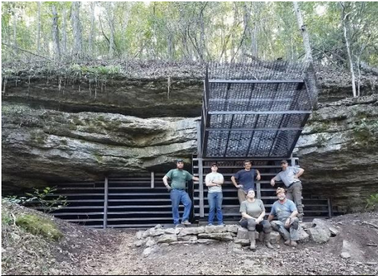
Cobb Cave gate, Nixa, Missouri, completed