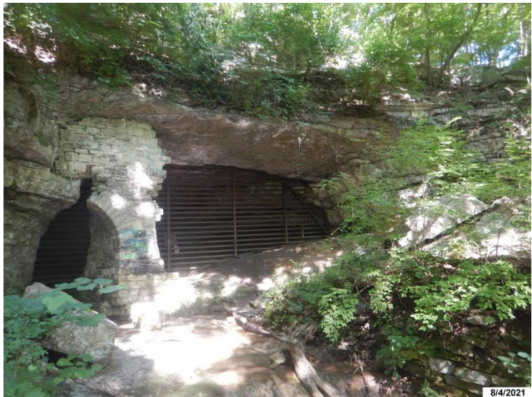
Cliff Cave gate – St. Louis County