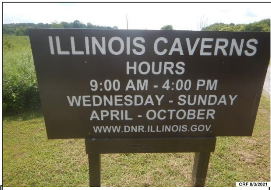
Illinois Caverns is open to the public for unguided wild cave tours