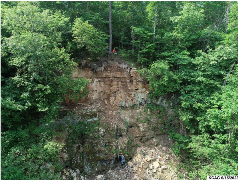
Investigating Rock Slide Bluff at Cloud 9 Ranch.

rockslide that occurred earlier in the year on the south side of Spring Creek. The investigation was conducted via drone (Krout) and rappel (Erickson, Teriet). Despite some promising openings, nothing large enough to admit a human was found on the exposed cliff face created by the rockslide. Cooley,