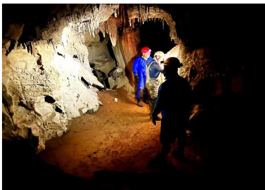
Virgin Shannon Co. cave