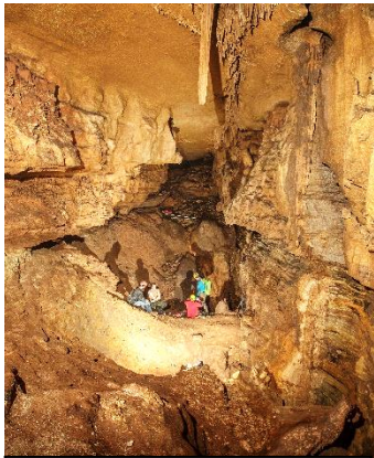
11/12/23 Pleasant Valley Cave overall 5