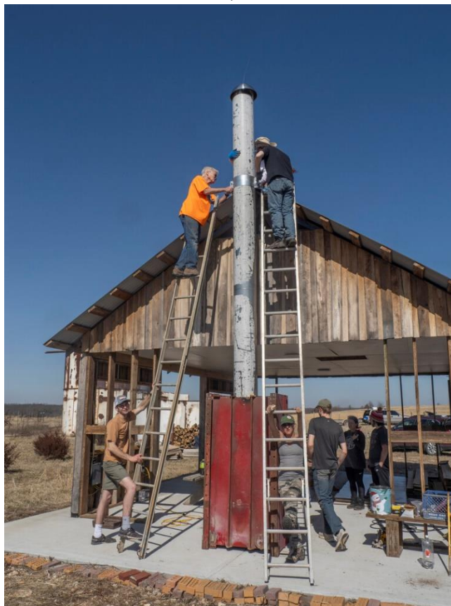
Installing the fire box at Carroll Cave Pavilion