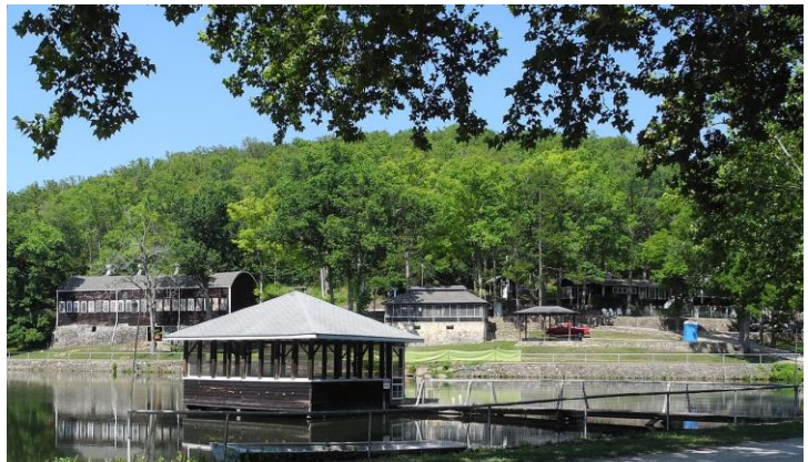
Alton Club at Current River State Park.

The fall meeting will be the weekend of Sept. 7-9 at Current River State Park, which is the old Alton Club, used as a company retreat by the Alton Box Board Co. and developed in the 1930s and 1940s. The site contains a lodge, dorm rooms, gymnasium and other structures, which we are making plans to utilize. Indoor sleeping will be limited but we will be able to set up camp adjacent to the Current River on site and use the river access to put in and take out canoes for monitoring. Part of our agreement is to do some restoration work at some of the caves at Echo Bluff State Park and set up an interpretive station