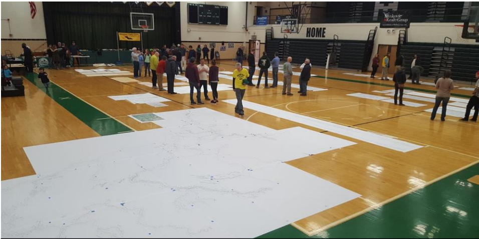
A caver examines Paul Hauck's Crevice Cave map in the foreground with numerous fine maps displayed in the background.

Lastly, the February meeting of the Meramec Valley Grotto was a spectacular map display set up on the gymnasium floor of Mehlville High School in St. Louis. The quality of work displayed was a testament to the dedication and skill level of Missouri cave cartographers. Maps included a wide range of Missouri selections from numerous cartographers, some being modern, recently completed maps as well as older, classic maps.