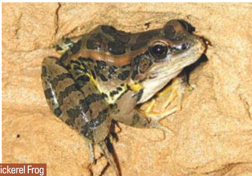
William R. Elliott

Eurycea spelaea (Stejneger), SB: Older larva, 50-120 mm long. As the animal matures its eyes and pigment regress. Some larvae are larger than adults, up to 90-120 mm long. Note the external gills along each side of the head. See adult pictured on cover.