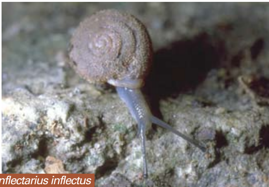
James E. Gardner

Fontigens aldrichi (Call and Beecher), SP: This tiny cavesnail (<2 mm) probably is overlooked in many caves and springs, where it is found under submerged rocks or rotting leaves and wood. Usually there is little organic detritus in streams where these snails are found. Five hydrobiid snails are found in Missouri: Three Fontigens , Ammicola stygia and Antrobia culveri ; the latter is unique to Tumbling Creek Cave.