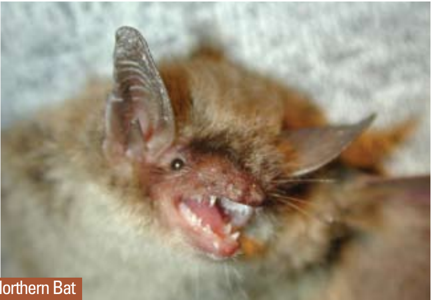
William R. Elliott

Hibernating gray bats, Myotis grisescens , often form loose clusters. Their habit of hanging upon other bats produces multiple layers in some clusters. Hibernates in very large numbers in only a few cold-air-trap caves.